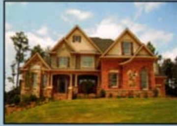
Quality Inspections for 25 Years

Licensed Child Care Infants and Toddlers